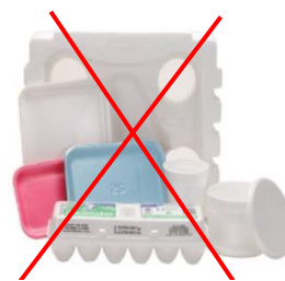
Polystyrene Foam, Styrofoam Containers