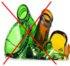
Glass of any Kind