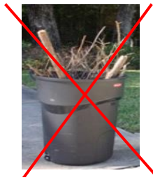
Yard Debris & Dirt